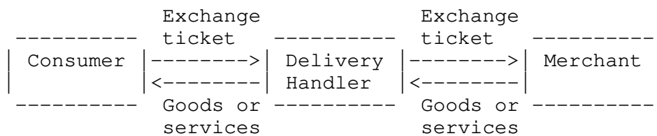
Figure 3. Coordination of untrusted participants using exchange ticket

Take the exchange ticket as an example; even if the delivery handler does not trust the consumer, the merchant that issued the exchange ticket is trusted, and if the VTS guarantees that there is no duplication in the trading process of the exchange ticket, there is no problem in swapping the exchange ticket for the goods or services. In the same way, even if the merchant does not trust the delivery handler, the issuance of the exchange ticket can be verified, and if the VTS guarantees that there is no duplication in the trading process of the exchange ticket, there is no problem in swapping the exchange ticket for the goods or services (Fig. 3). In other words, if there is trust in the issuer and the VTS, trust among the participants involved in the transactions is not required.